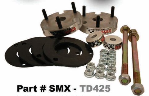
Part # SMX - TD425 2000 - 2006 Tundra