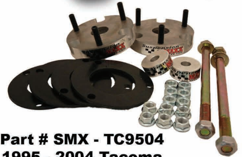
Part # SMX - TC9504 1995 - 2004 Tacoma