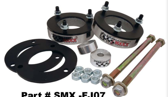
Part # SMX -FJ07 2007 - 2010 FJ Cruiser